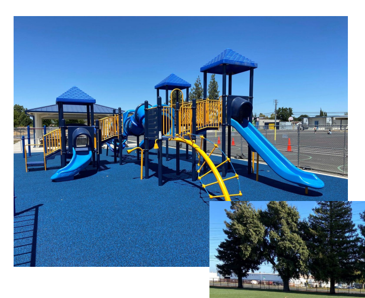
Elder Creek New Hardcourt, Irrigation and Field