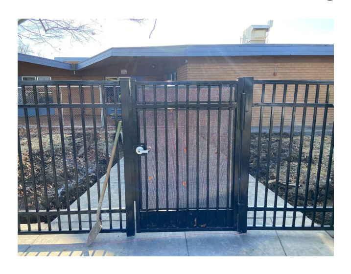
Security Fencing Multiple Sites