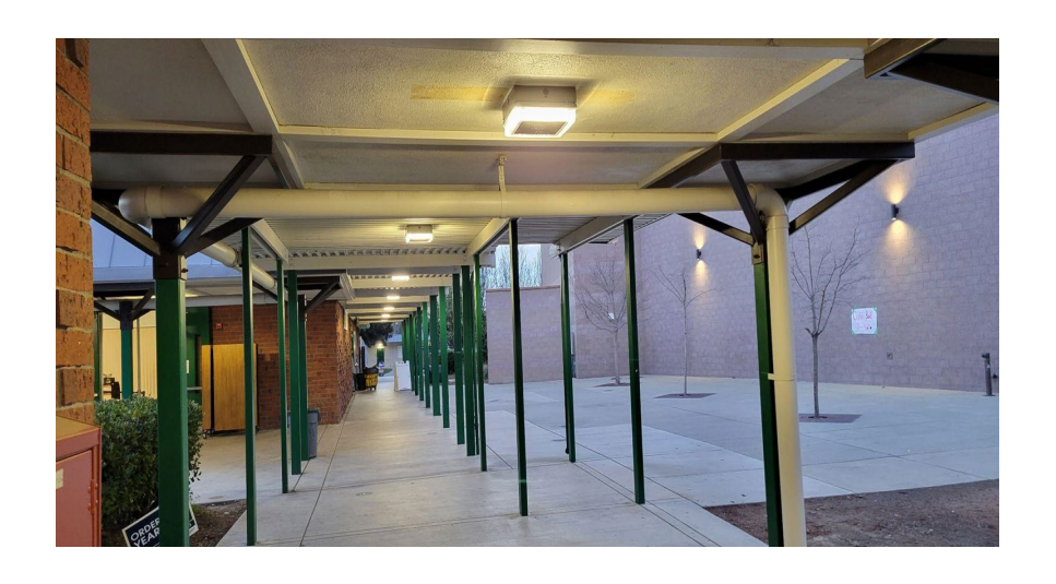
LED Lighting Exterior Retrofit Phase 1 Multi-site