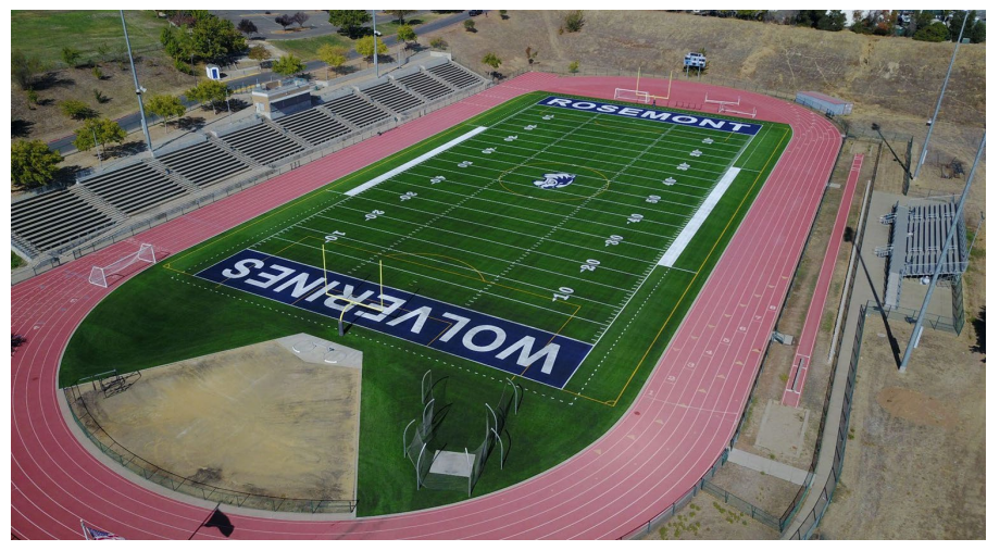
Rosemont High School Turf Replacement