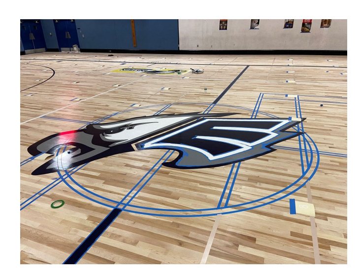
Albert Einstein New Gym Floor